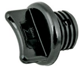
BU42 - 18mm