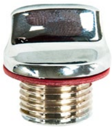
BU27 - 19mm Chrome

To help you recognise and order the correct bung, the available replacement ones are shown below with their A dimension.