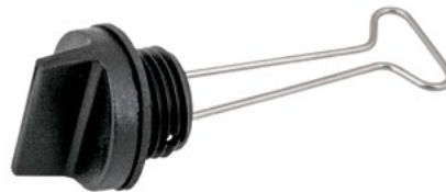
BU52 - 19mm fine thread