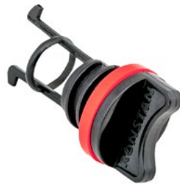
BU295 - 16mm