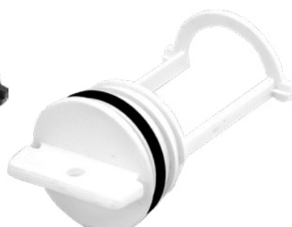
BU397 - 40mm