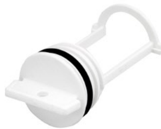
BU37 - 31mm