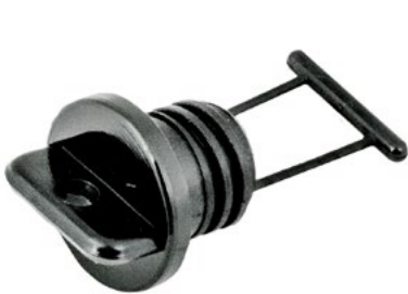
BU62 - 16mm