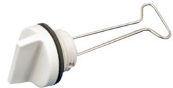
BU52W - 19mm fine thread