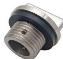
BU29 - 19mm Stainless Steel

Click on your selected bung and you will be taken to the correct section of the Tenob website.