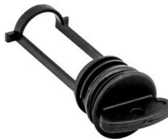
BU302 - 21mm