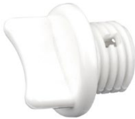
BU47 - 18mm