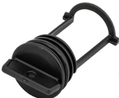
BU392 - 40mm