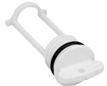
BU307 - 21mm