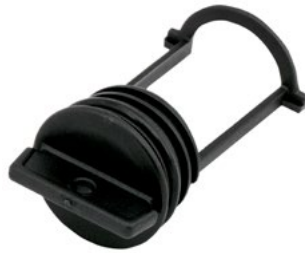
BU32 - 31mm